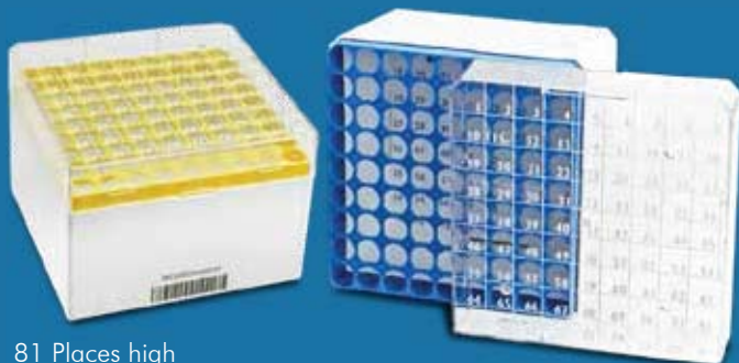
81 Places high