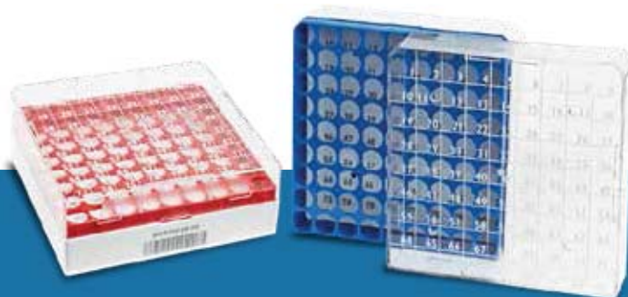
81 Places low