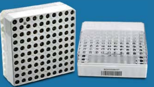
100 Places 2D low