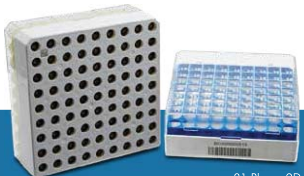
81 Places 2D low