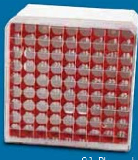
81 Places high