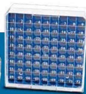
81 Places low